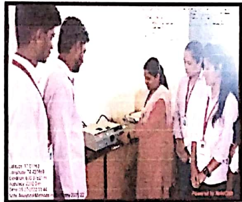
Student doing analysis of the some Chemical Samples by Spectrophotometer